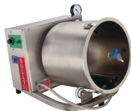
HVT-30 Vacuum Tumbler