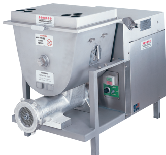
Mini-Matic Tabletop Mixer/Grinder