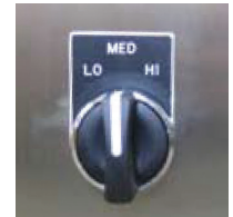
3-speed selector switch for flexibility