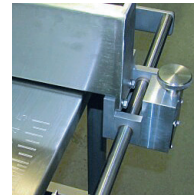
Portion Control Meat Gauge