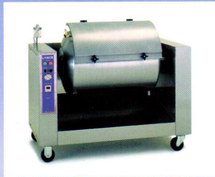
* LT 30 FLOOR MODEL * LT 15 FLOOR MODEL