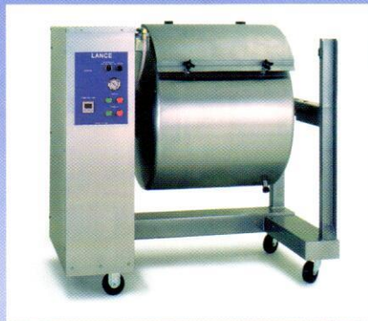
* LT 15 FLOOR MODEL * LT 30 FLOOR MODEL