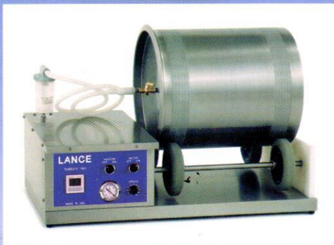
* LT 5 COUNTER TOP UNIT * LT 5 COUNTER TOP UNIT