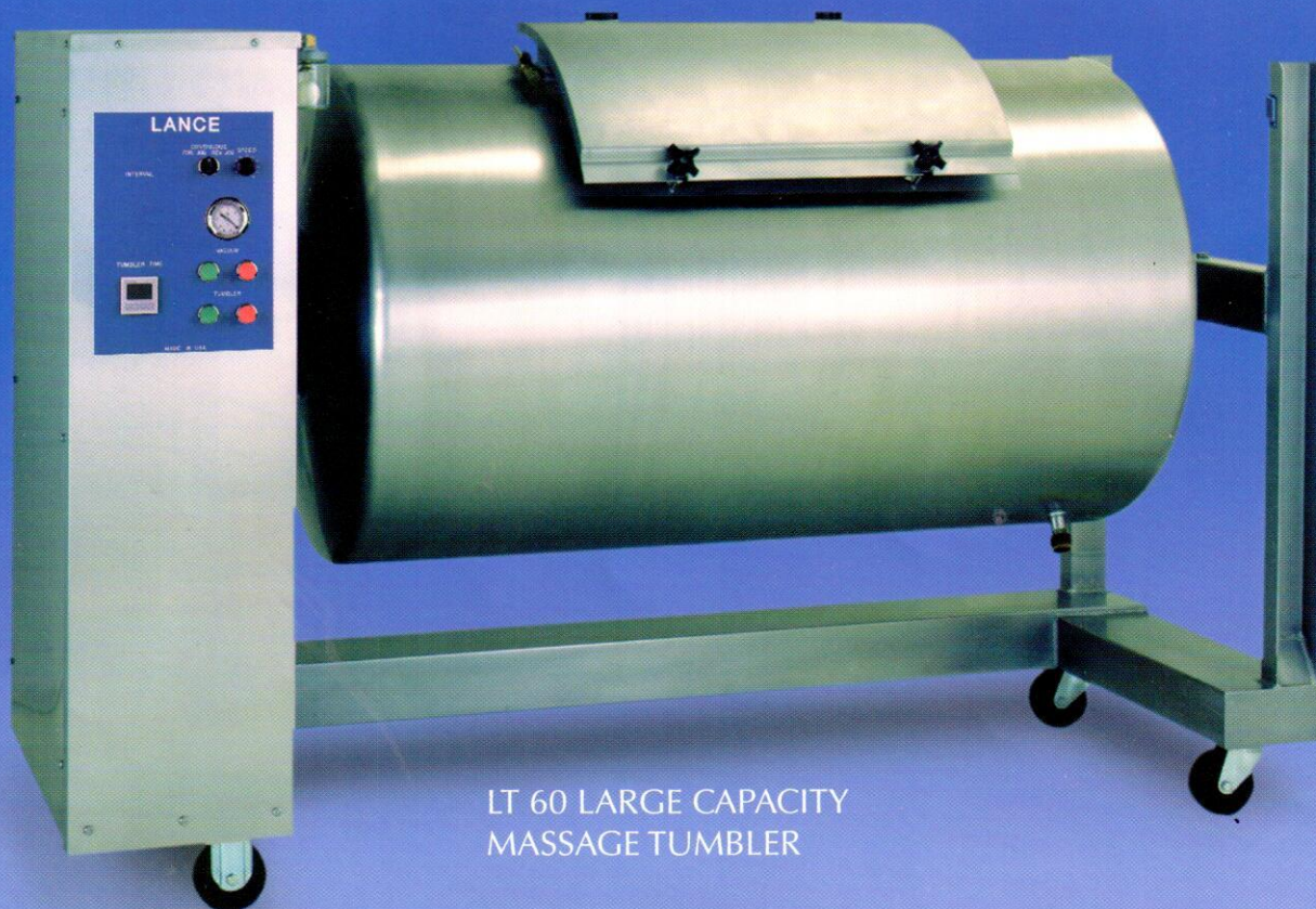
LT 60 LARGE CAPACITY MASSAGE TUMBLER