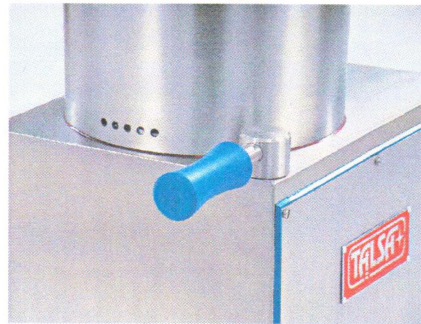
Easy to use, knee lever