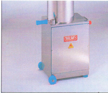
Conforms to safety & sanitation regulations