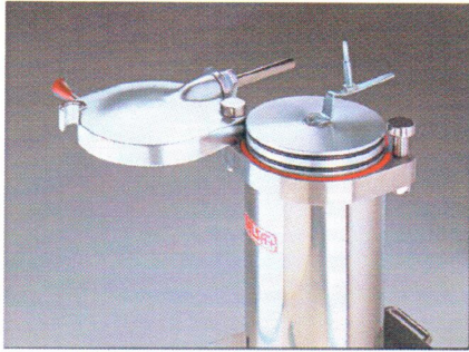
Uniform piston sealing, durable construction