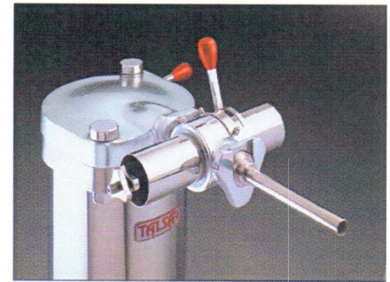
Optional portioning device 2 oz. to 1 lb.

Barrel capacity, Gal. Barrel capacity Motor power, 3-phase Motor power, 1-phase Lid and Piston Weight (Net)